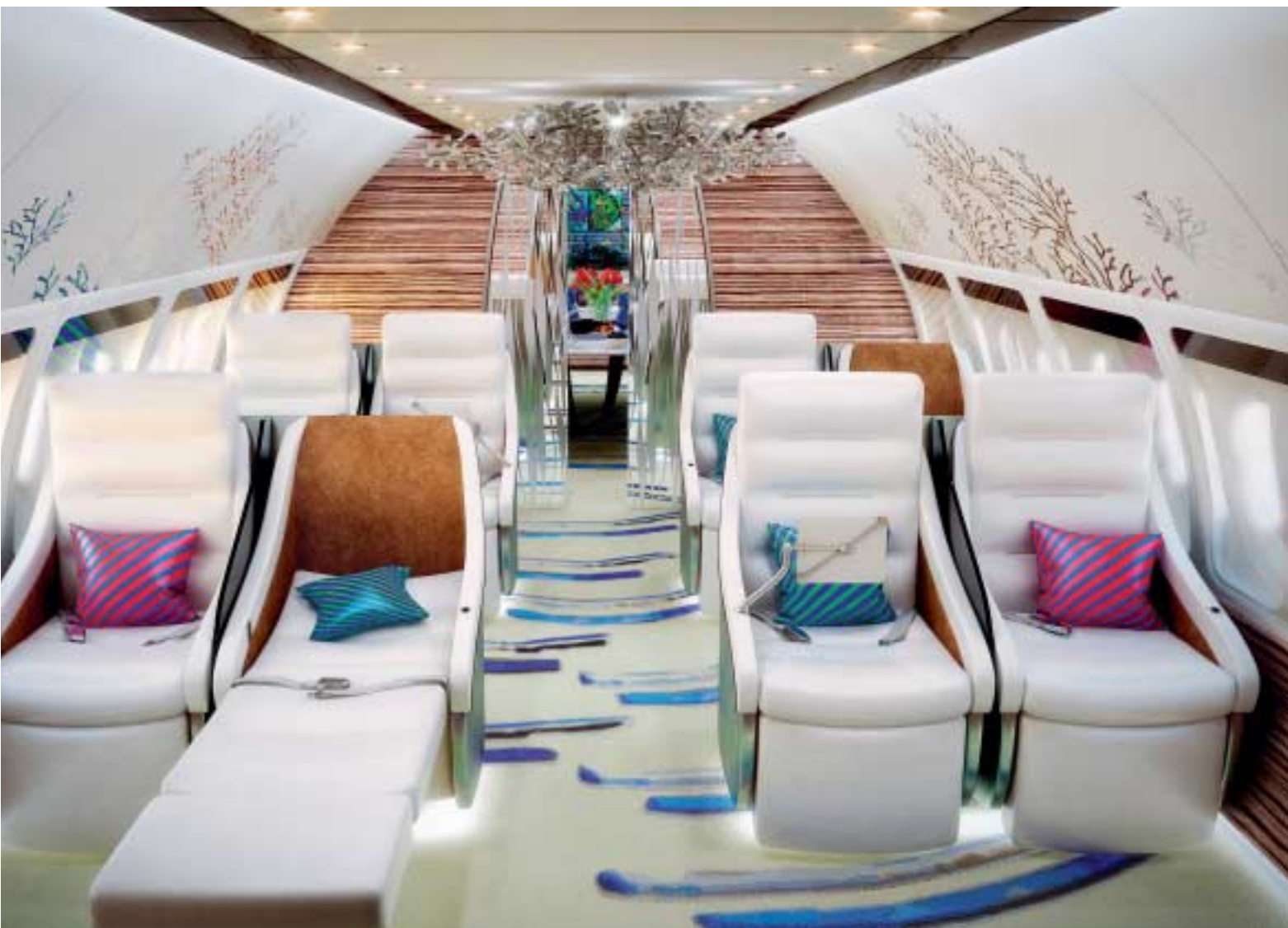
Forward facing seating area, with a wool and silk hand-tufted carpet in a sand color with circular blue simulated waves and water ripples

section, a lounge, a private bedroom and a bathroom with shower.