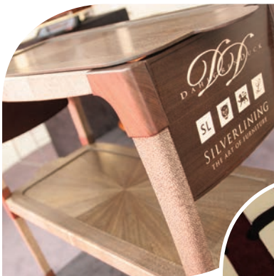
A VIP catering trolley shown by Dahlgren Duck and Silverlining