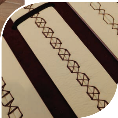
IM Kelly Aerospace said a lot of designers had expressed interest in its range of non-standard upholstery stitch patterns

VISIT WWW.BUSINESSJETINTERIORSINTERNATIONAL.COM FOR FULL NEWS COVERAGE